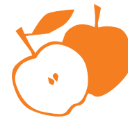
Access to Healthy Food