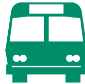
Health-related Transportation Services