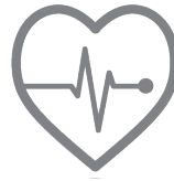
Wellness & Fitness Programs