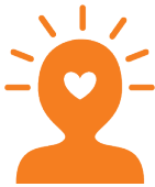
Mental Health Services