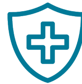
Foodborne Illness Prevention