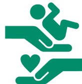
Health Services for Foster & Adopted Children